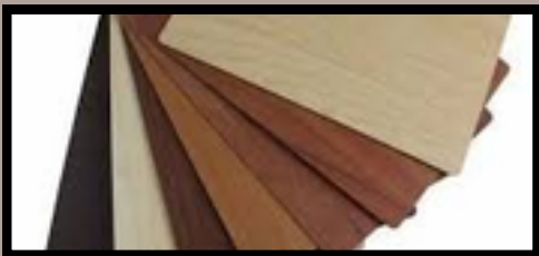
TABLE TOPS & DISPLAY SURFACES:

We supply custom-sized tops made from laminated plywood or HPL to be used as event counters, display tables, and workstations.